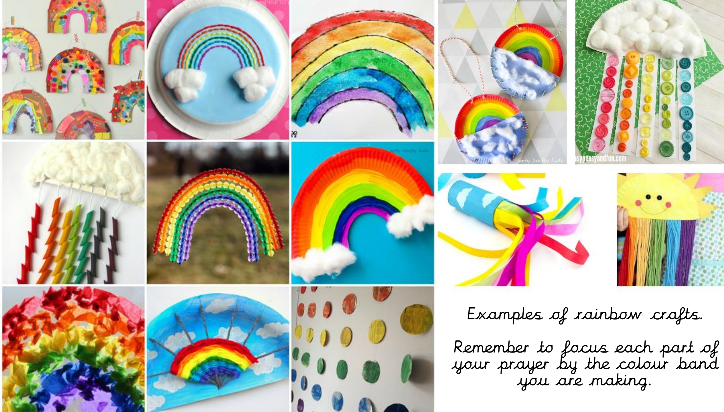
Examples of rainbow crafts.

Remember to focus each part of your prayer by the colour band you are making.